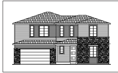
Home Exterior B