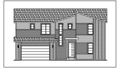
Home Exterior C