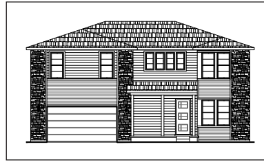
Home Exterior B