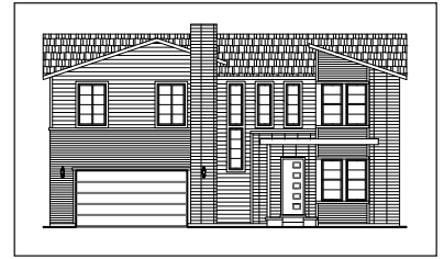
Home Exterior C