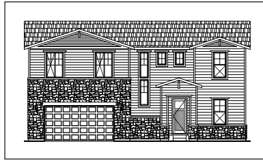
Home Exterior A