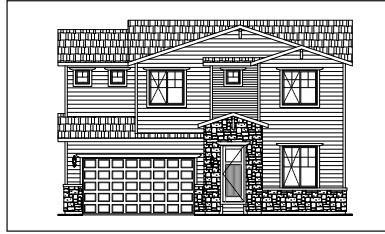
Home Exterior A