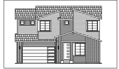
Home Exterior C