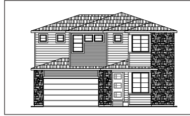
Home Exterior B